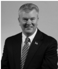
Director since 2009