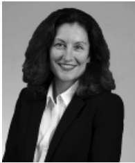
Director since 2007