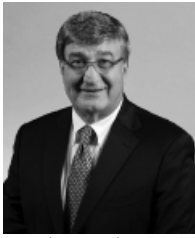
Director since 2004