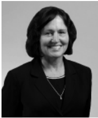
Director since 2002