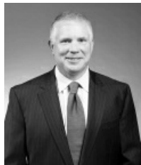
Director since 2015