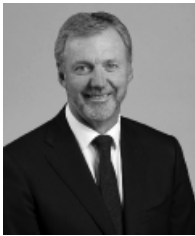
Director since 2010