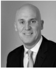
Director since 2016