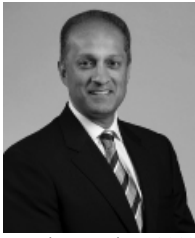
Director since 2013