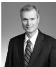
Director since 2015