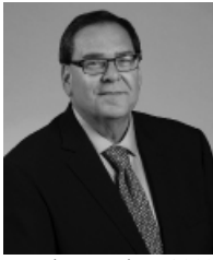
Director since 2010